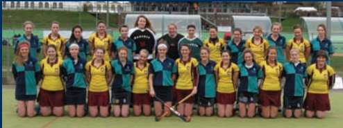
King's High and Bablake hockey teams