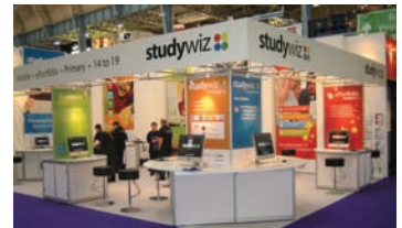
The Studywiz stand at Olympia