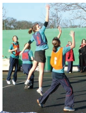
Inter Form Netball

Over 100 girls from Year 9 and 10 participated in the inter form netball and hockey competitions in January. A healthy competitive atmosphere and superb sport were on display.