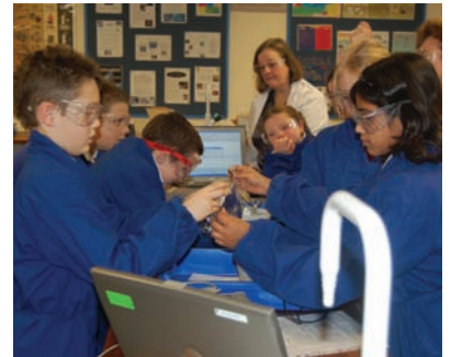
Children from All Saints Primary School experimenting

Budding young scientists from two local primary schools recently visited King's to take part in scientific experiments. An impressive 117 Year 5 and Year 6 pupils from Coten End and All Saints Primary Schools made use of our innovative and up to date science equipment. They used data loggers and laptops to record results of a practical science experiment which looked at the effect of insulation on warm water cooling on ice: a great hands on experience for all involved and one to remember.