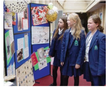
Above: Darwin on display in Red Corridor

Darwin's 200th anniversary was celebrated at school through numerous innovative events. The catering team made dinosaur biscuits for the girls and the staff enjoyed birthday cake. Years 10 and 12 made displays describing Darwin's life and his work on the origin of species by natural selection as part of their biology curriculum. The displays, erected in the main school building, were enjoyed by all girls and staff. The Art department contributed a wonderful and apt picture of a beetle collection, and a collection of books from the school library was put on display. The activities certainly fired the imaginations of the girls to learn more about this pivotal scientist.