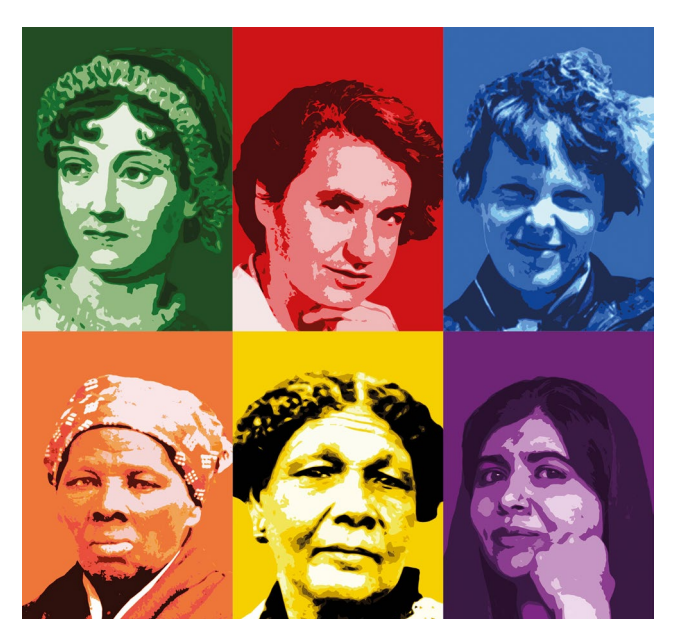
Global Changemaker Programme