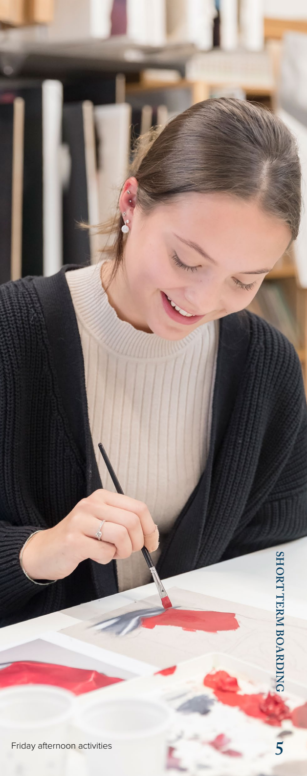
King's High teacher and pupil